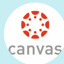
Course Location Online (UF Canvas)