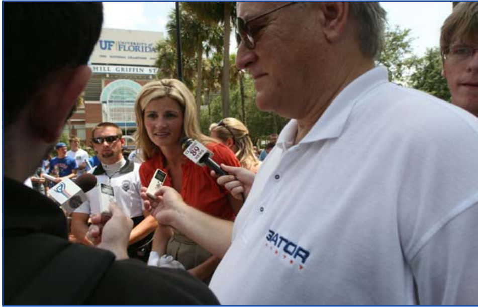
ESPN reporter Erin Andrews, TEL 2000, taped a segment for the sports network's national contest "TitleTown USA" earlier this month outside the stadium.