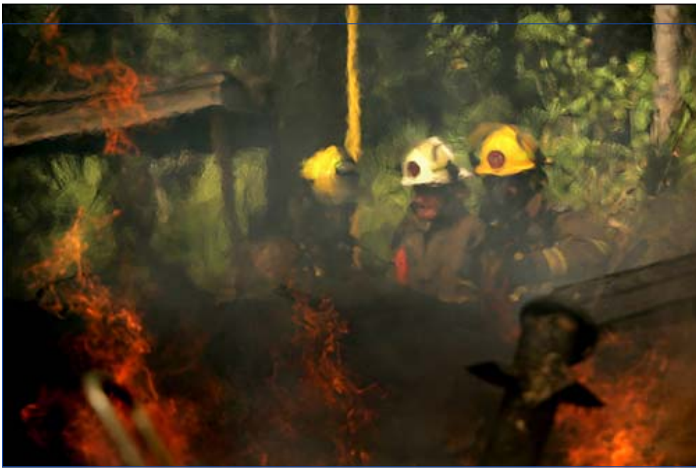
This photo by Daron Dean, JM 2004, is being exhibited at The Smithsonian Museum of Natural History and will appear in the winter edition of Nature's Best Photography magazine.