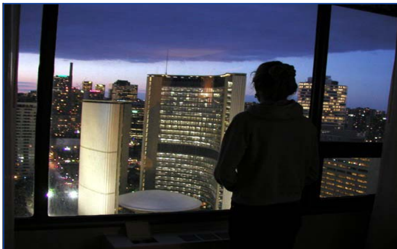
A room with a view