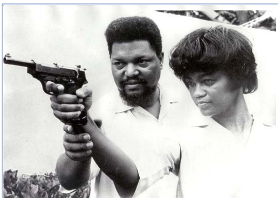
“Negroes with Guns” has been appearing in film festivals.

The Documentary Institute’s “Negroes with Guns” won the documentary feature category earlier this month at Urbanworld Film Festival in New York. Spike TV presented the award.