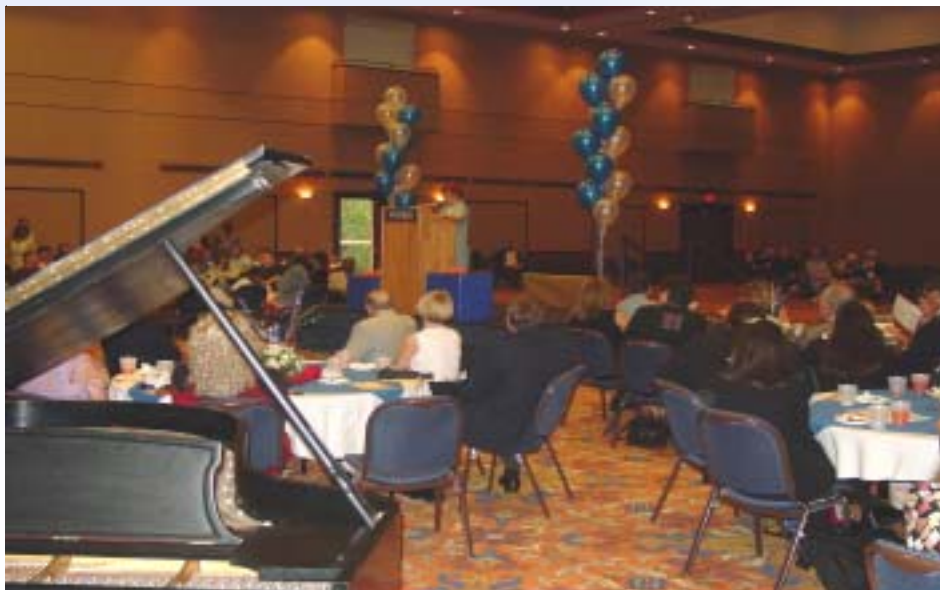
Retiree celebration in the Reitz Ballroom, April 25