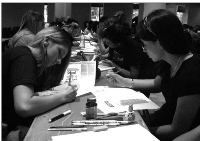
Students participate in an on-the-spot contest at the 2008 convention, in Tampa, Fla. These competitions will now be held at USF.

ENTERTAINMENT: The entertainment for convention is always one of the most exciting See CONVENTION on page 2