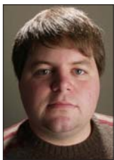
By Nick West Student Photographer

When I think back to my days as rookie photographer in high school, one of the biggest problems I had was learning how to avoid dead space. Fortunately, my staff had community volunteers who shared helpful tips I would now like to pass on as space is available in each issue of FSPA Today .