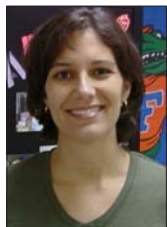
By Haley Brueck Broadcast On-the-Spot Contest Chair

Hi everybody! We made some changes and improvements to the broadcast contests this year and want to make certain everyone understands the information included in the FSPA 2003 convention booklet. Just for clarification, pull out your copy of the convention booklet and review the following areas of special concerns.