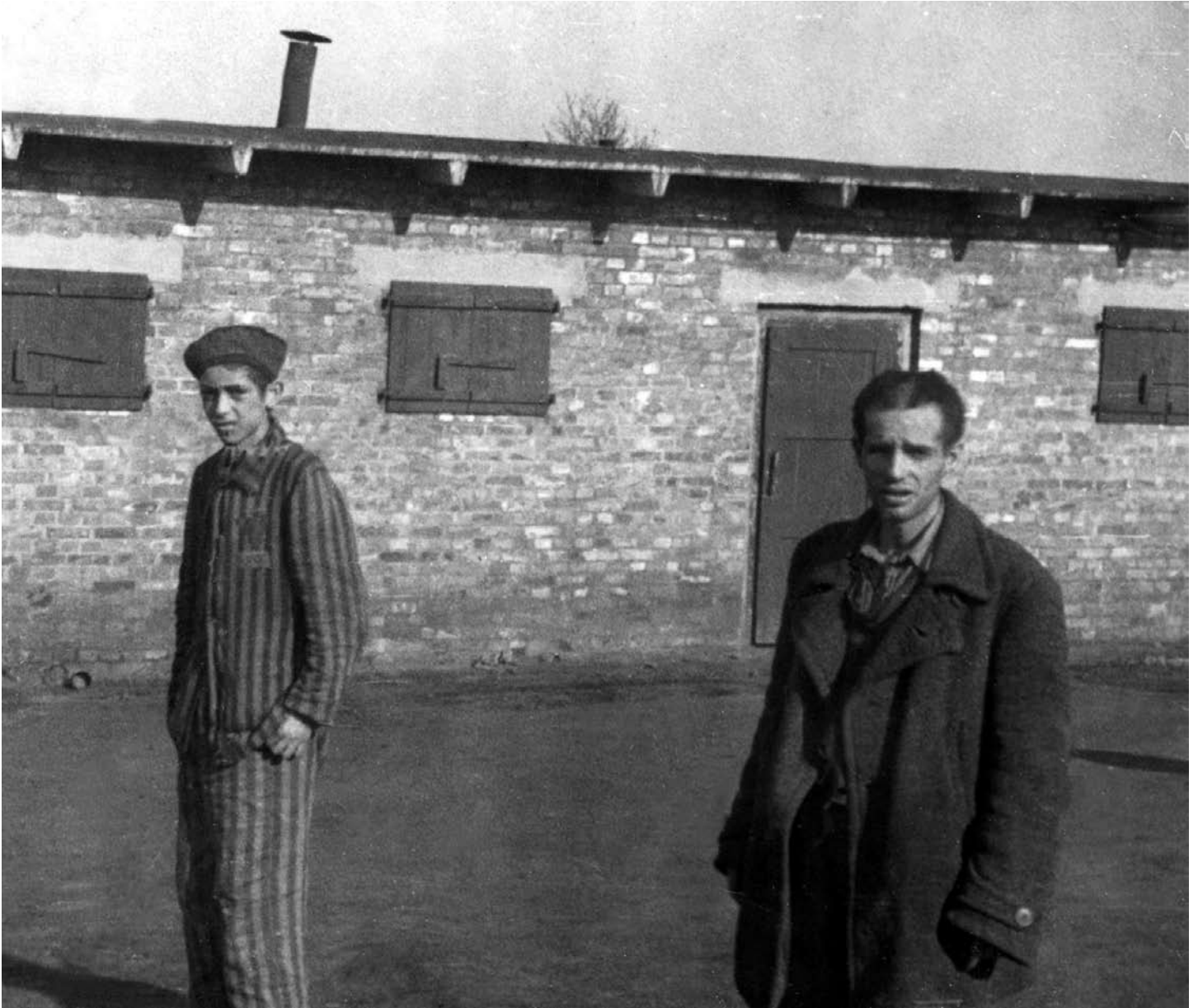
Identified as the Jacobowicz brothers, both are deceased